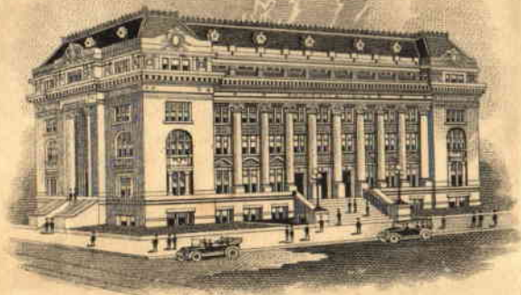
MUNICIPAL BUILDING DALLAS